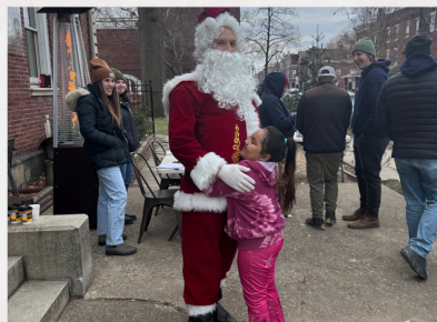
CHRISTMAS AT THE MANSION