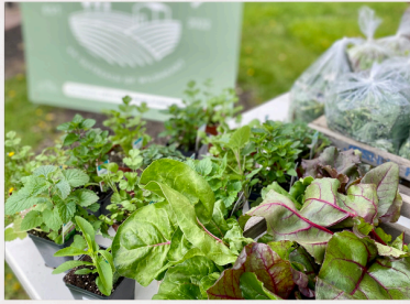
FRESH PRODUCE IN A FOOD DESERT