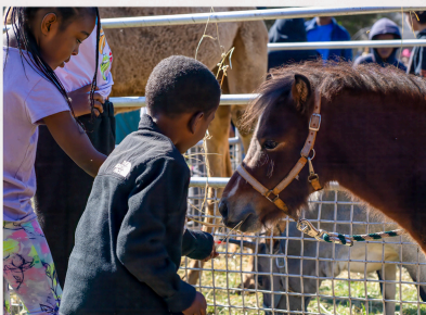
QUARTERLY BLOCK PARTIES

Through our community engagement program we were able to provide 1128 meals to our community, host 4 block parties , give 393 personalized Christmas gifts to kids and mentor 3 teen interns through our youth workforce development program.