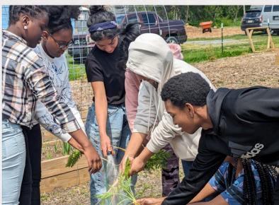
EDUCATIONAL FIELD TRIPS