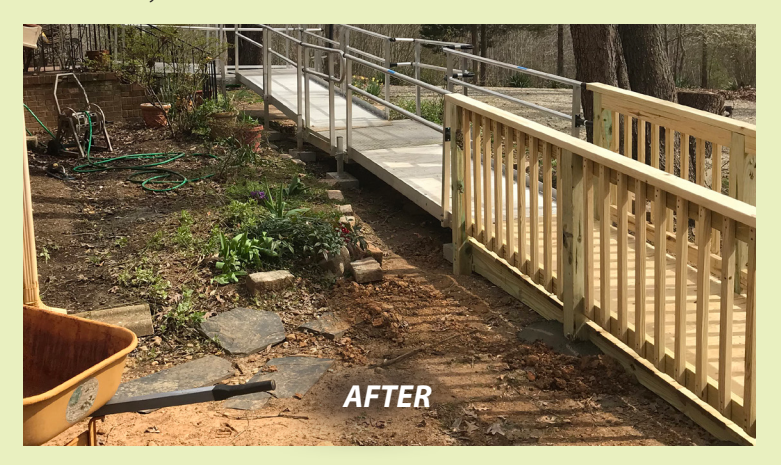
Interested in learning more about Home Preservation or donating to this program? Visit www.orangehabitat.org/homepreservation

In partnership with the Home Depot Foundation, Habitat was able to install an entrance ramp and replace the home's leaking roof in mid-March to ensure the couple is able to age comfortably in their home.