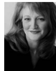
Krista Tippett conceived the idea of “Speaking of Faith” — a public radio program to bring a wide range of thoughtful religious voices into American life.