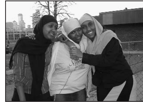
The Lighthouse Academy is a charter high school teaching immigrant and refugee youth the knowledge and skills to succeed.