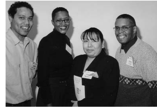
Graduates of Twin Cities Rise are trained for skilled jobs that pay a living wage and full benefits.