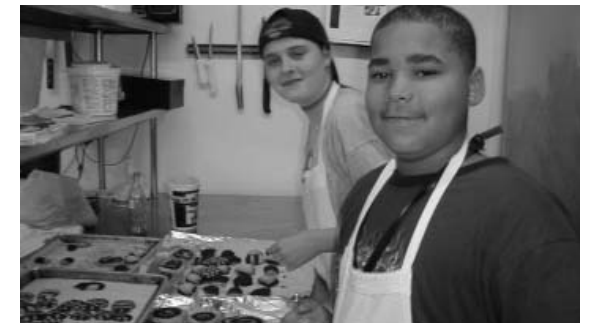
In Lucia's kitchen kids from Youth Farm Market learn food preparation and baking skills.