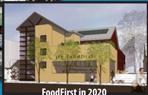
FoodFirst in 2020