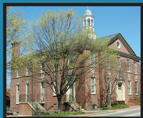
Historic Town Hall

The Food Pantry, Emergency Financial Assistance and offices will close March 25-29 to pack and move. We will all re-open on April 1 at 100 W. Rosemary Street in Chapel Hill.