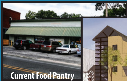
Current Food Pantry