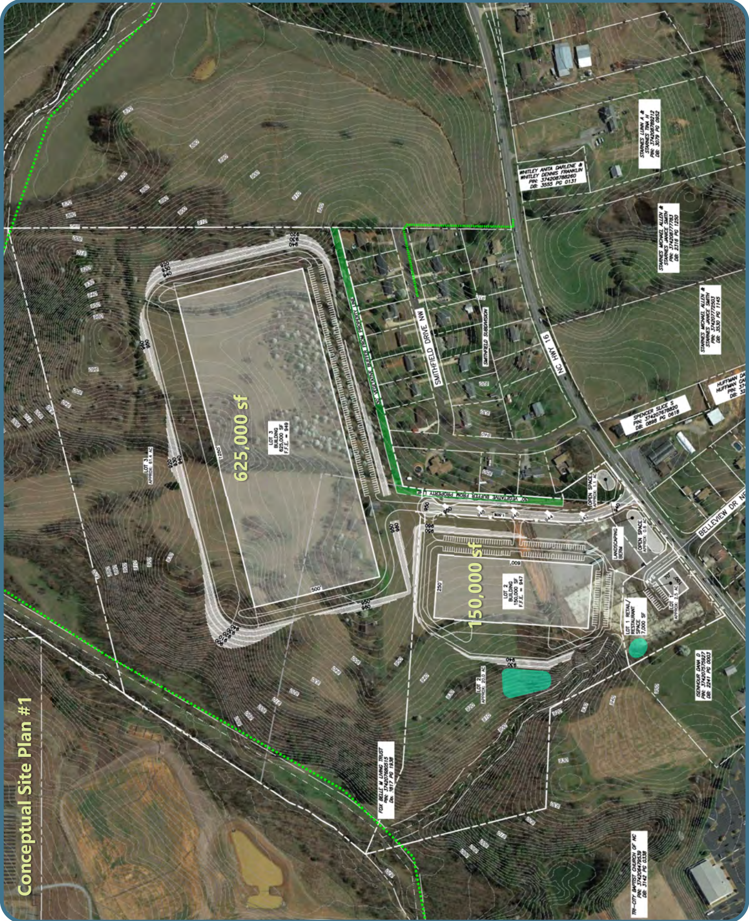
Conceptual Site Plan #1