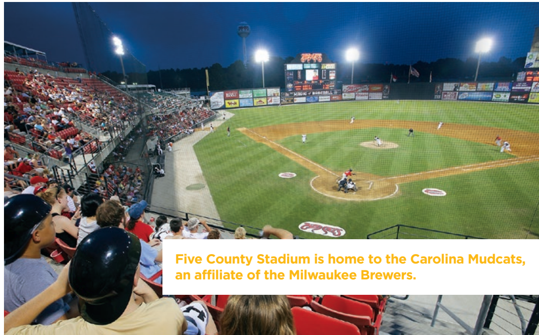
Five County Stadium is home to the Carolina Mudcats, an affiliate of the Milwaukee Brewers.