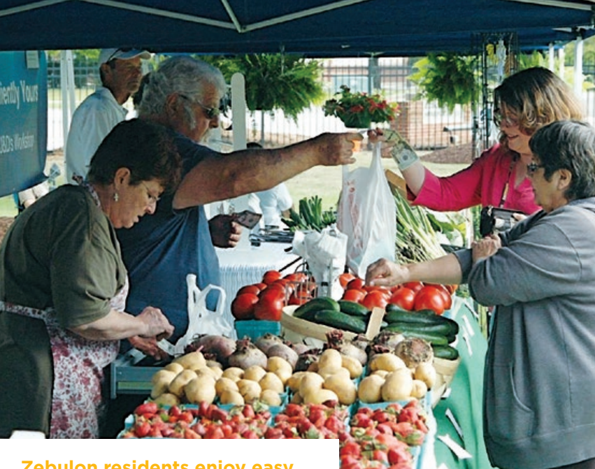
Zebulon residents enjoy easy access to parks and open space.