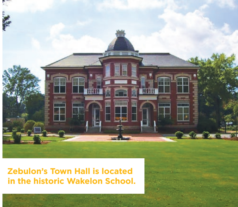
Zebulon's Town Hall is located in the historic Wakelon School.