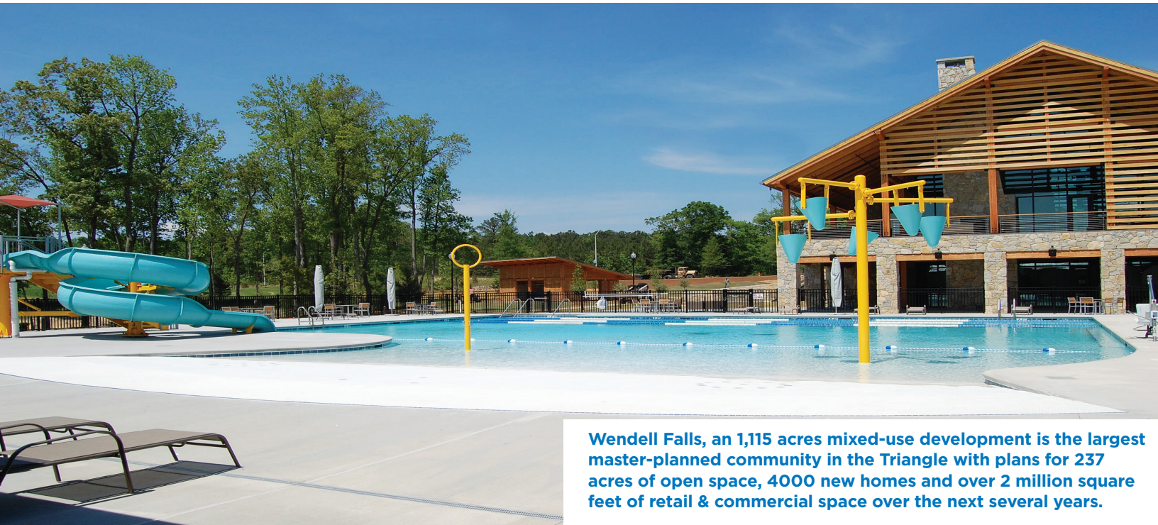
Wendell Falls, an 1,115 acres mixed-use development is the largest master-planned community in the Triangle with plans for 237 acres of open space, 4000 new homes and over 2 million square feet of retail & commercial space over the next several years.