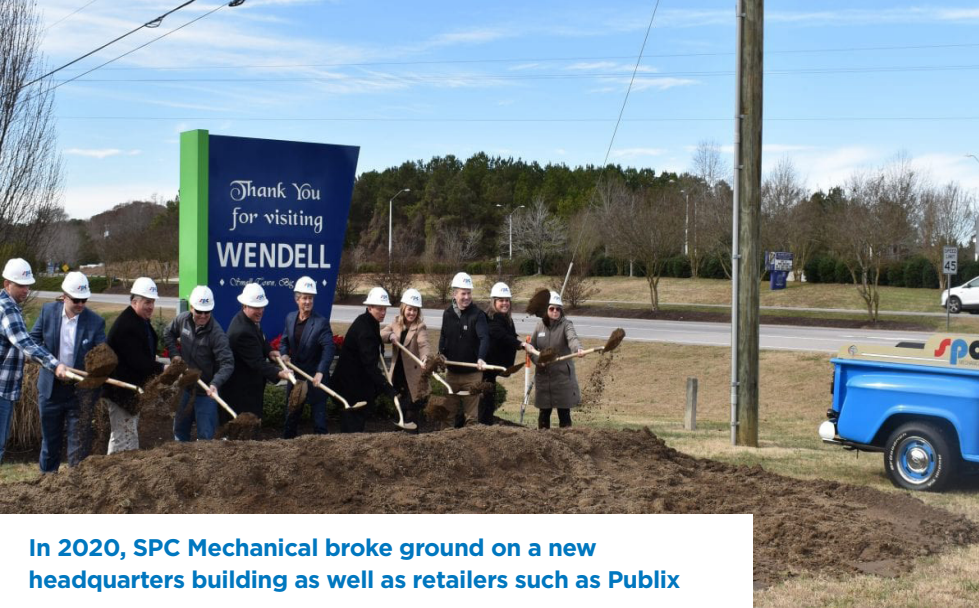
In 2020, SPC Mechanical broke ground on a new headquarters building as well as retailers such as Publix