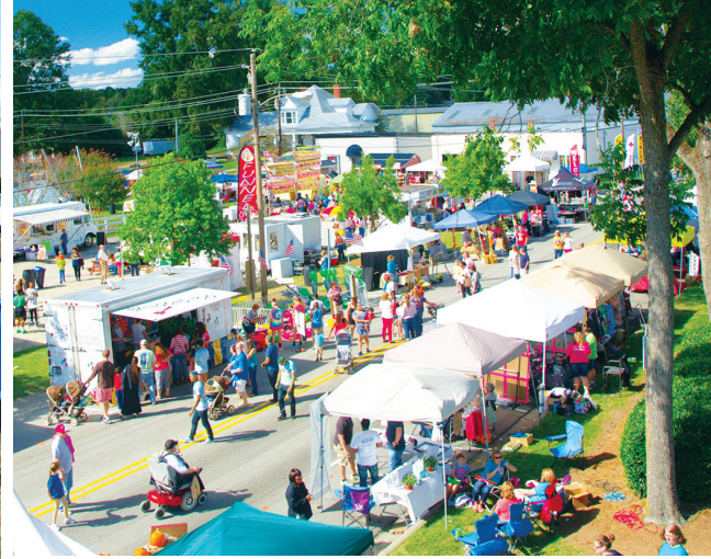
Downtown Wendell hosts numerous family-friendly events throughout the year