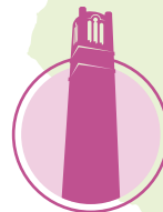
NC State University