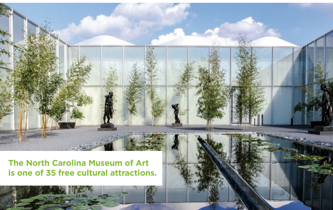
The North Carolina Museum of Art is one of 35 free cultural attractions.

With 2,000 artists in 200+ events, SPARKcon is an open source, “for the people, by the people” event.