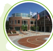
RALEIGH North Carolina