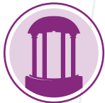
UNC Chapel Hill