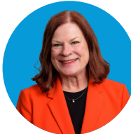
Mary-Ann Baldwin Mayor City of Raleigh