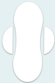
Pads (or Sanitary Pads or Napkins)

When you have your period, you will need to use something to soak up the menstrual blood. There are lots of different products to choose from. Ask for help about a product if you are unsure if it is for you. A nurse, family member or friend can help you decide.