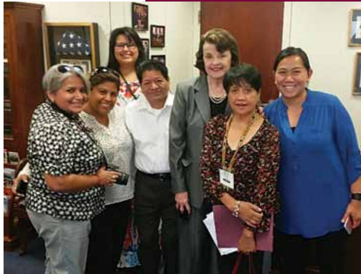
IWJ affiliates met with Senator Feinstein as part of a lobbying day on Capitol Hill.

Despite the significant challenges we face in passing any federal legislation both before and especially since November 8, IWJ is committed to intensifying our organizing to do whatever we can to move these bills or alternative policy solutions forward and win meaningful victories for working people.