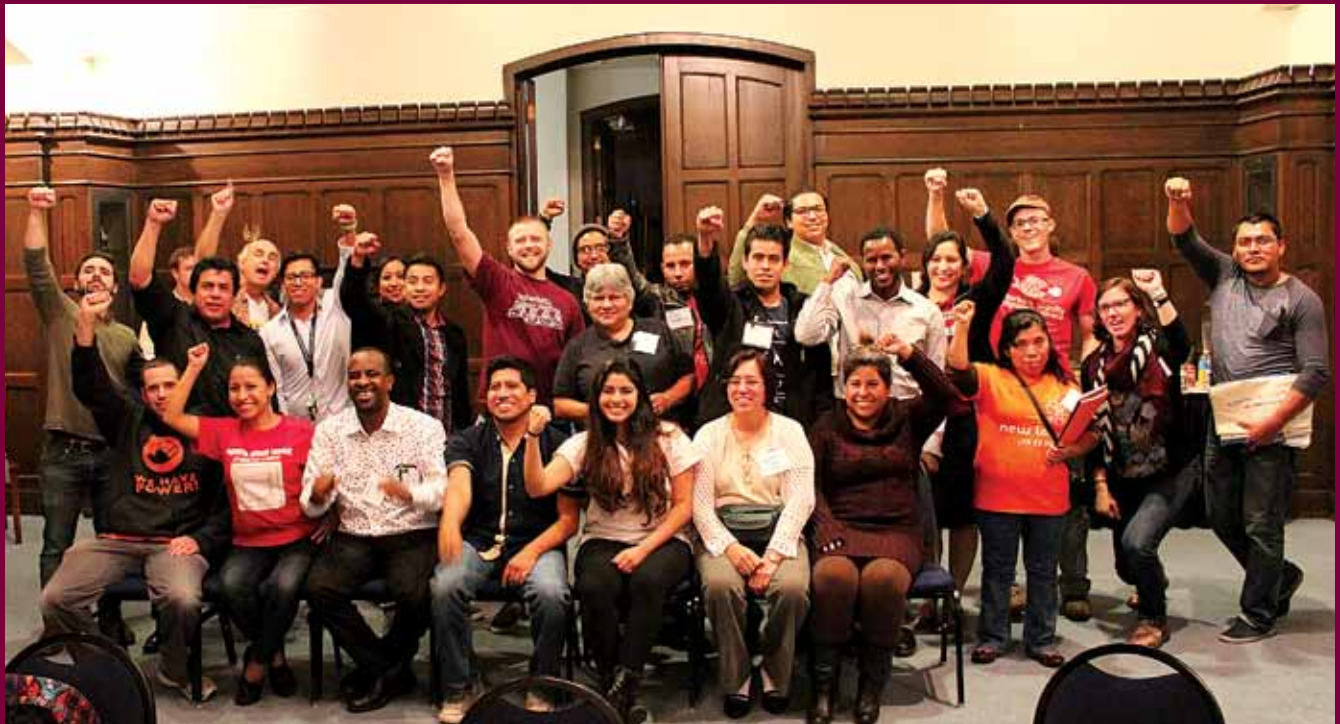
IWJ Health and Safety Training in Nashville.

the minimum wage and win workers' rights for paid sick days. The Center for Worker Justice of Eastern Iowa was a key leader in efforts in Johnson County, Iowa to pass the first local minimum wage ordinance in the state's history. After more than a year of organized action by low-wage workers and faith leaders, the county board voted to raise the minimum wage to $10.10 an hour over the next three years with an automatic annual cost-of-living adjustment thereafter.