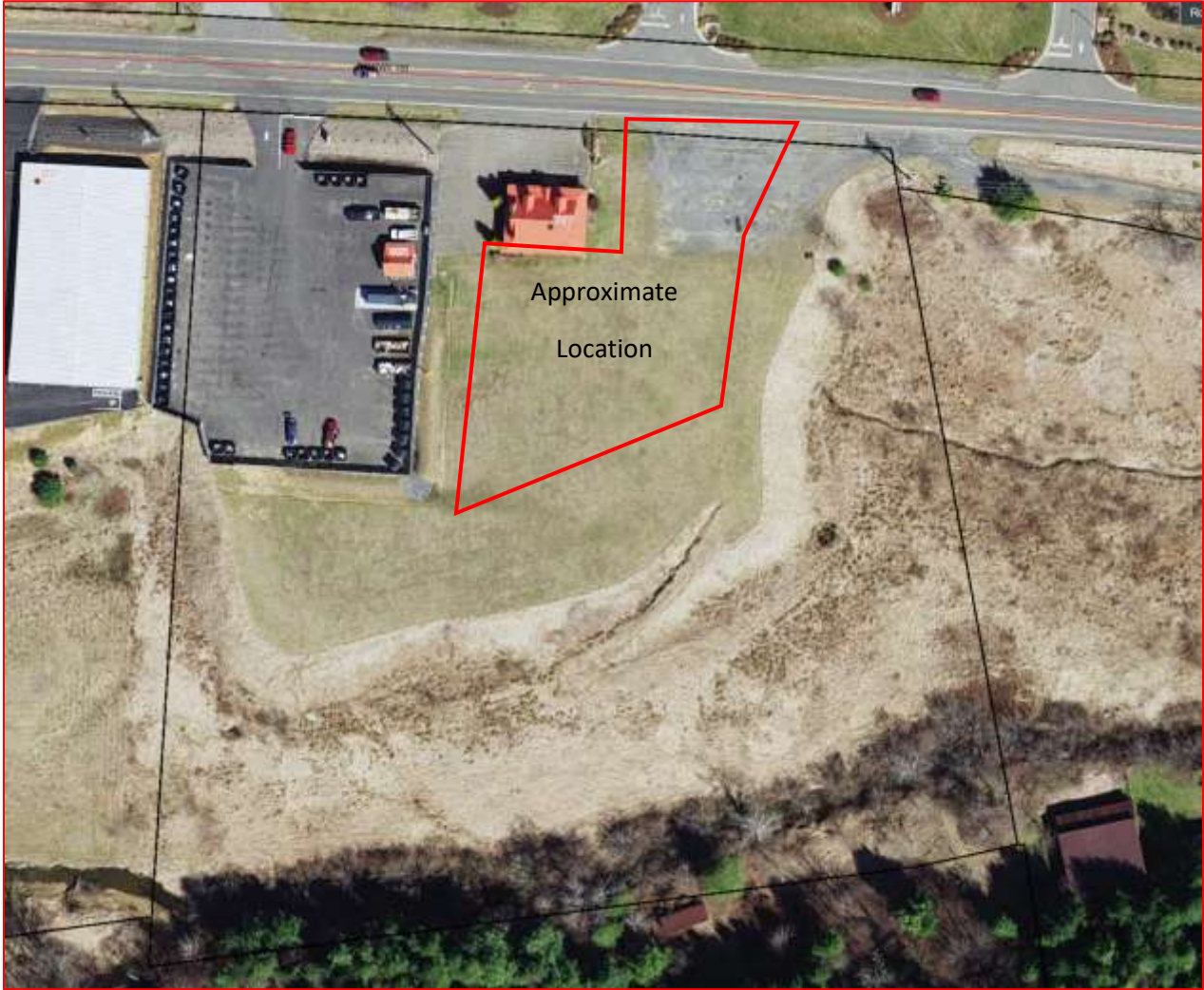
Exhibit A: Aerial Site Map