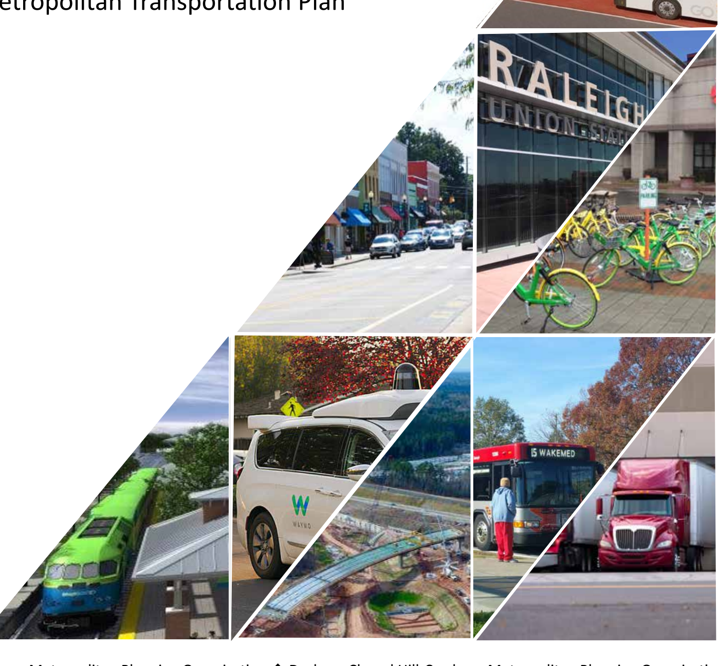
Capital Area Metropolitan Planning Organization ❖ Durham-Chapel Hill-Carrboro Metropolitan Planning Organization

The Research Triangle Region's Metropolitan Transportation Plan