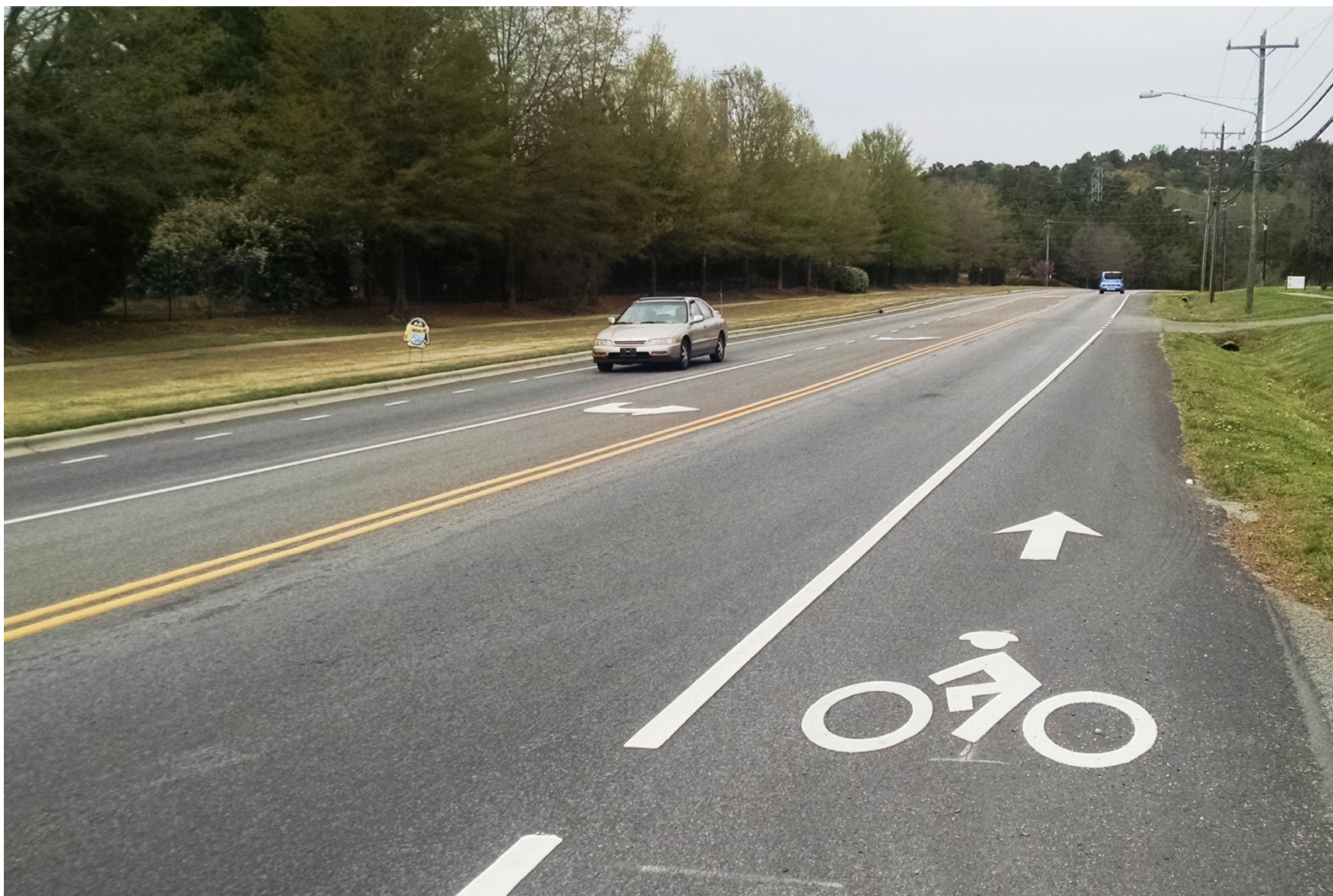
New Bicycle Lanes