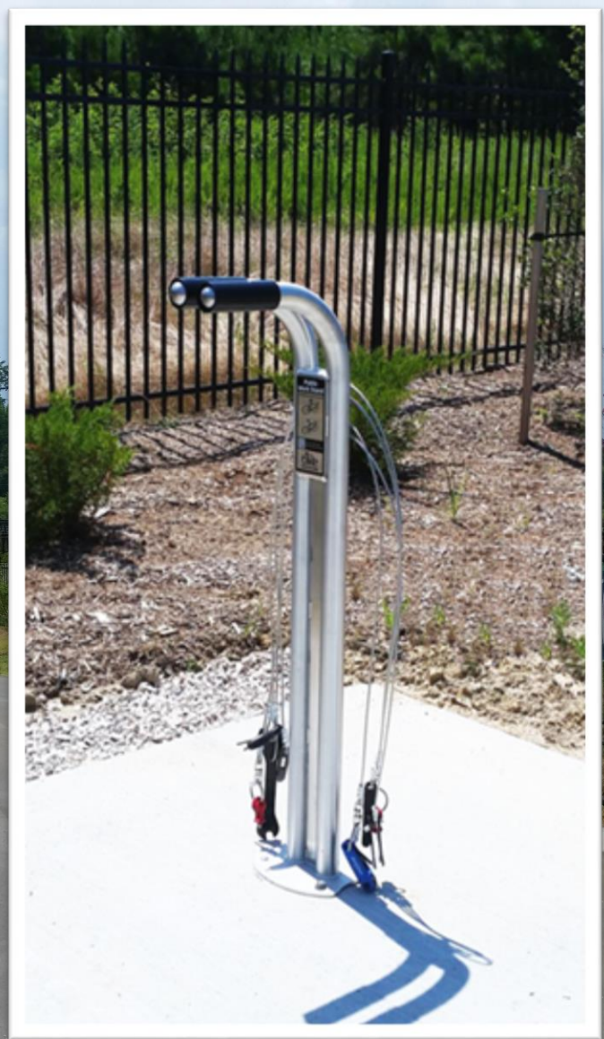
Old Reedy Creek Road Trailhead at Black Creek Greenway