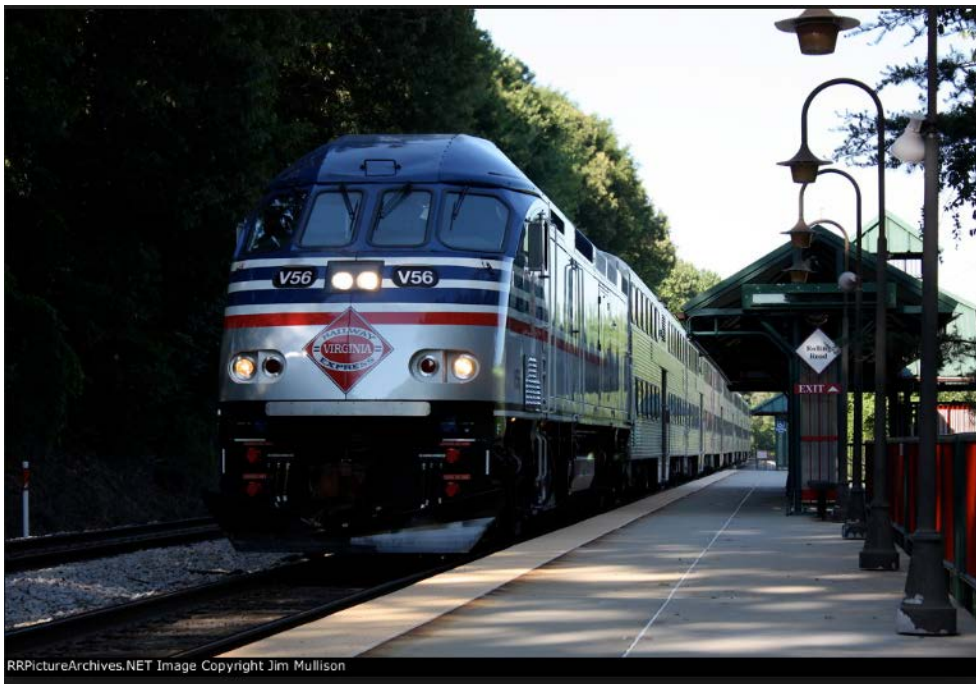
VRE Rolling Road Station (Burke, VA)

All CRT stations are recommended to include the following features: