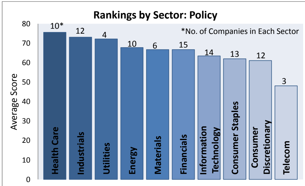
Chart 3: Sector Rankings by Policy

Note: Averages are based on the percentage of the maximum score achievable – 69.