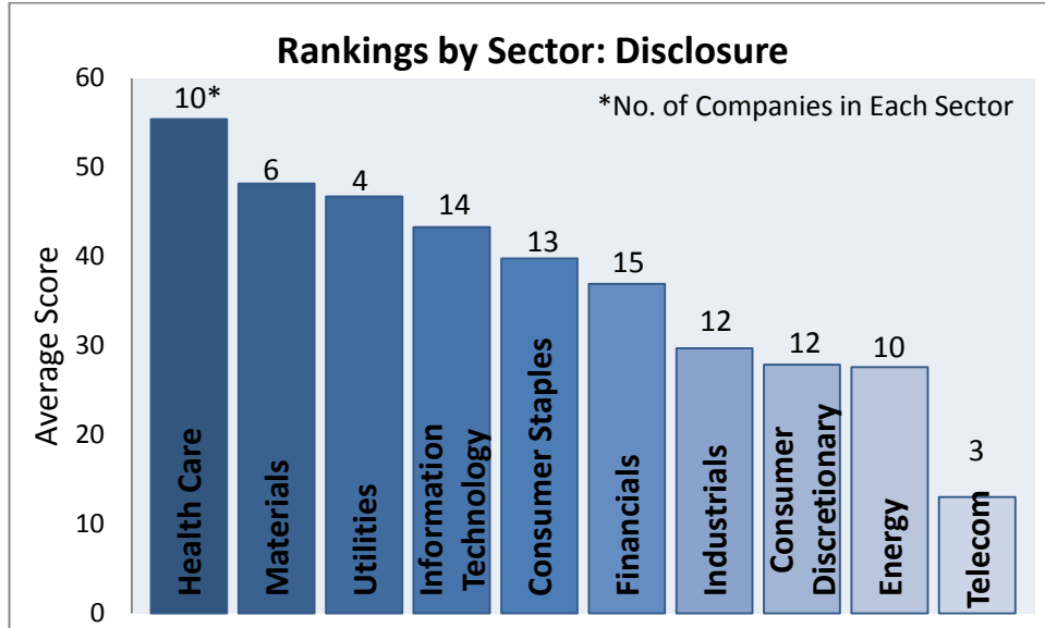
Chart 2: Sector Rankings by Disclosure

Note: Averages are based on the percentage of the maximum score achievable – 69.