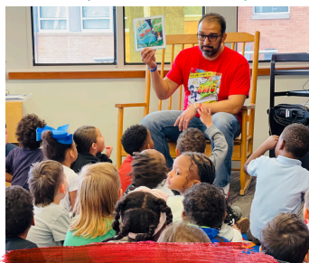
READ ACROSS AMERICA AT MEREDITH DUNBAR ELEMENTARY