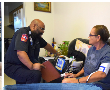
BRIDGES AT CLIENT'S HOME