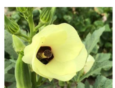
Okra Bloom - July 16, 2018