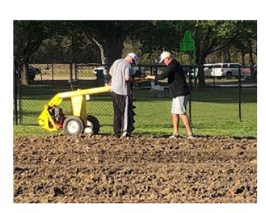
The auger helped dig the 28 holes (April 14, 2018)