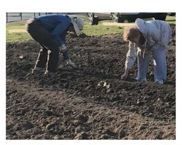
The first seeds going in the ground – April 14, 2018.