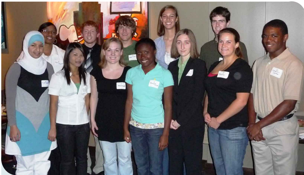
The NCCF hosted several receptions throughout the state last year to honor scholarship fund-holders and recipients. This particular student group represents 12 different scholarship funds held by the NCCF. They attend NC State University, Shaw University and Wake Technical Community College.