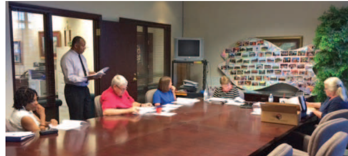
The Martin County Community Foundation meets with nonprofit executives as they work on their Blueprint for Success.

developed a plan to focus work called "The Blueprint for Success." The Blueprint sets out a planning process that local advisory boards are using based on their affiliates' and local communities' needs. In addition to leveraging grantmaking to maximize impact, other focus areas in the Blueprint include: developing strong boards reflective of the local communities we serve; inspiring local philanthropy to grow affiliate assets and a "family of funds;" and positioning affiliate leadership as catalysts to address community needs. We are extremely proud of the progress that our affiliates have made and the importance they place on their work. We have said many times that NCCF's affiliate network is one of our key differentiators and our biggest opportunity to deliver on our mission to ensure that philanthropy is accessible throughout the state, with a focus on rural North Carolina. An effective affiliate network is essential to this work.