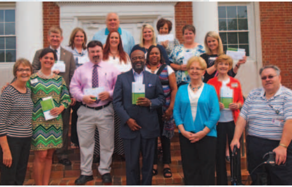
Every year most of NCCF's affiliates sponsor local community grants programs. Board members and grantees from the Montgomery County Fund celebrate this year's awards.

We are pleased to announce that we soon will begin administering Biogen Foundation's "Ignite the Power of STEM" grant program. The grants will support public and charter schools and nonprofits in the development and delivery of science education and projects.