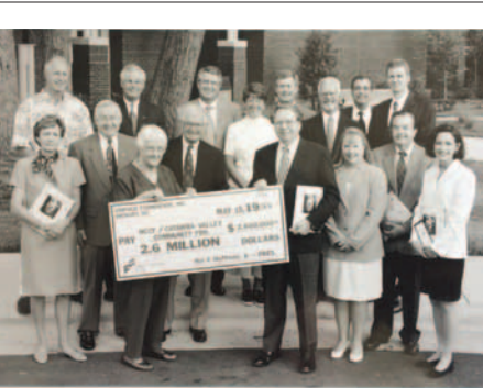
The first Unifour Foundation board presented NCCF with a check to establish the endowment in 1998. Visit our website to read more on the history and impact of this transformative fund.

We are proud that our corporate grantmaking program is growing. NCCF is honored to continue to administer Duke Energy's Community College Grant Program that funds workforce initiatives. This program has been expanded to include several of our state's public universities through the Duke Energy University Grant Program for Workforce Development, which we also administer. NCCF also handles Duke Energy's Water Resources Fund in five states and a program that focused on the Dan River Basin area of Rockingham County.