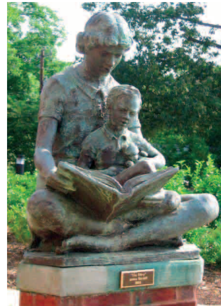
An effective appeals letter sent to a small but highly targeted list was successful for the Hickory Public Library, where this beautiful statue stands outside its main branch.

The NCCF also has many tools that can help you raise awareness about your endowment and increase its balance. A new fund