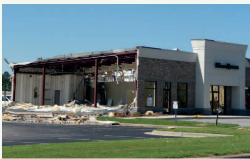
This dramatic damage to a Wilson County business is but one sad example of the devastation experienced across eastern North Carolina in April.