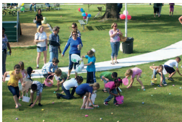
Frost Park has become a popular gathering place in Jones County.