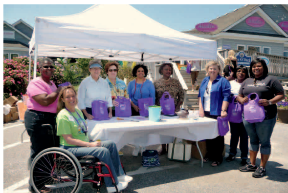
Volunteers help to make this event, held on the boardwalk at the Waterfront Shops in Duck, a huge success every year.

More than $9,000 was raised at the third annual Duck & Wine Festival for the Currituck-Dare affiliate's community fund and our charitable partners: the Network for Endangered Sea Turtles, Friends of Jockey's Ridge and Currituck Kids. This was the sell-out event's third year, with nearly 600 in attendance. Mark your calendar for this popular event next year: April 28, 2012.