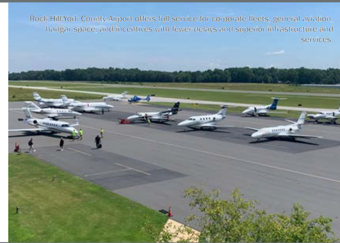
Rock Hill-York County Airport offers full service for corporate fleets, general aviation, hangar space, and incentives with fewer delays and superior infrastructure and services.

York County keeps growing, along with the infrastructure to support business expansion and the people who live and work here. I-77 has consistently seen improvements and widening over the years, with significant investment continuing on roadways across the county. Charlotte Douglas International Airport is just 15 miles from the state line and the deep-water Port of Charleston is an easy drive. Seamless connectivity to Atlanta and Raleigh and the rest of the world are here. York County is poised at the intersection of business, opportunity, and quality of life.