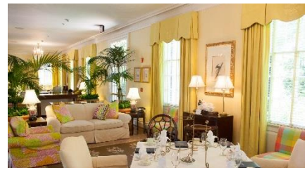
Carolina Inn – Photo Courtesy of Lindsay Suber

ON THE CAMPUS OF THE UNIVERSITY OF NORTH CAROLINA AT CHAPEL HILL