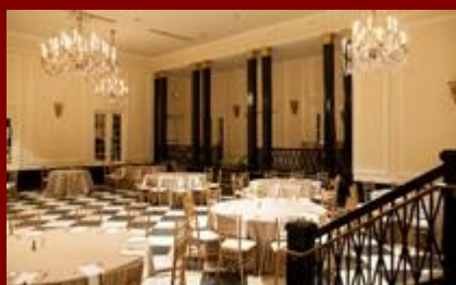
Old Well Ballroom – Lunch location at the Carolina Inn for Fall Meeting 2015