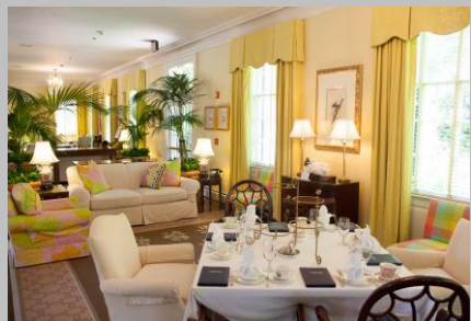
Carolina Inn