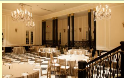
Old Well Ballroom – Lunch Location at the Carolina Inn for Fall Meeting 2014