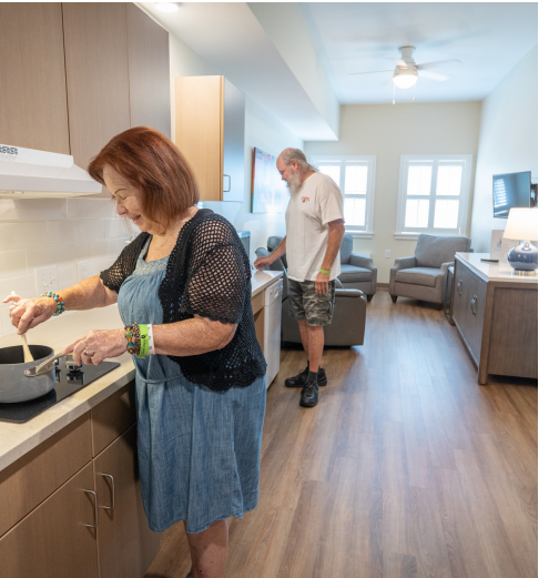
16 suites with a separate bedroom, complete kitchen, and sitting area. Sleeps up to 4