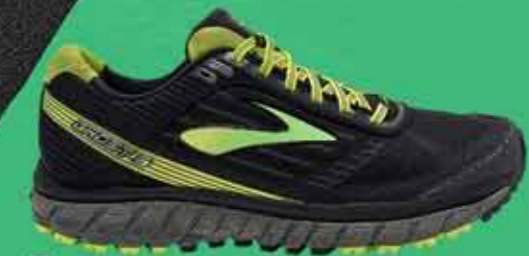
BROOKS GORETEX GHOST SHOES