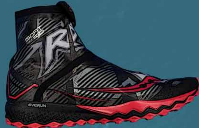
SAUCONY RAZOR ICE