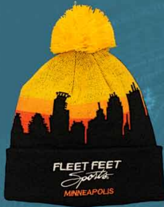
FLEET FEET MINNEAPOLIS EXCLUSIVE SKYLINE POM