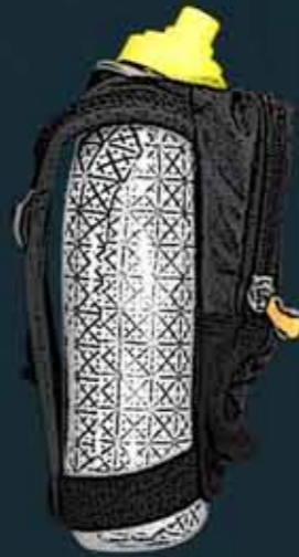
INSULATED, REFLECTIVE HAND-HELD BOTTLE