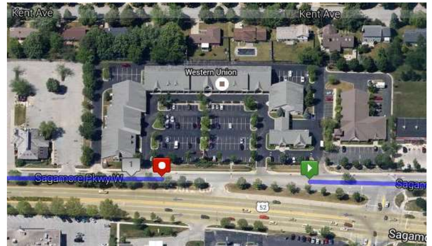
Start and Finish area